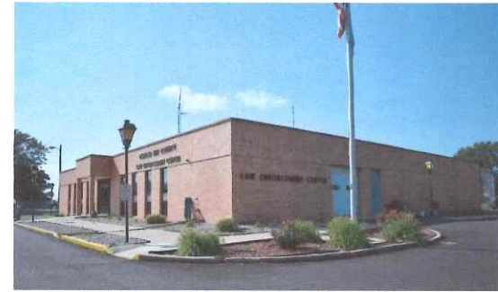
Law Enforcement Center

Removal of Underground Fuel Oil Tank—removal through the South Dakota Abandoned Tank Program July, 2017, at no cost to Charles Mix County