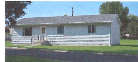
Juvenile Holdover Center