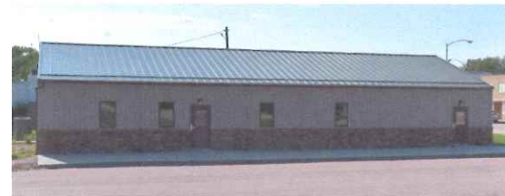
County Administrative Building