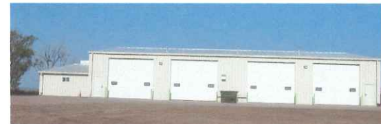
Wagner Highway Shop